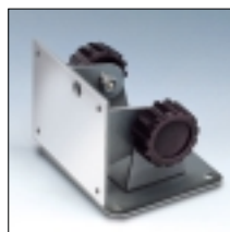
Wall Mount Kit